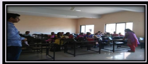
Teacher's day celebration by Students