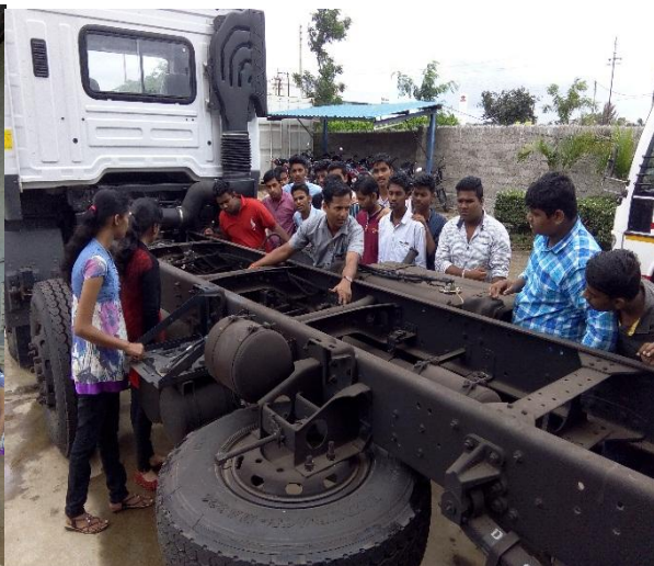
Industrial Visit at Trendy Wheels Pvt Ltd