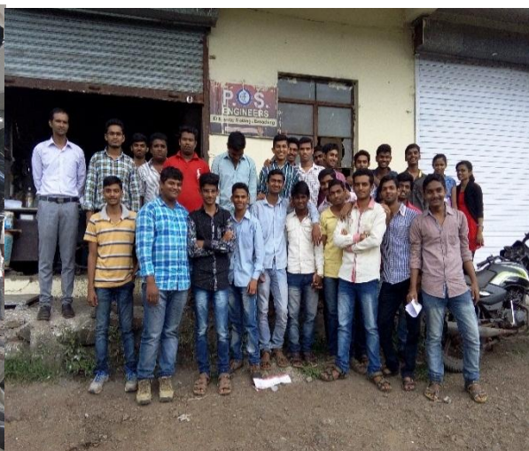
Industrial Visit at P.S.Engineers