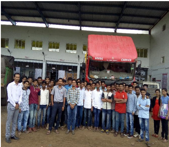
Industrial Visit at Trendy Wheels Pvt Ltd

Industrial visits are carried out for getting actual practices going in industries