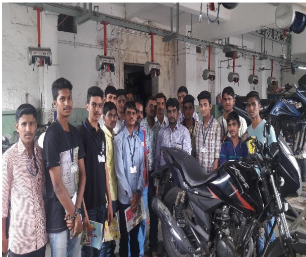
Industrial Visit at S.M.Ghatge and Sons